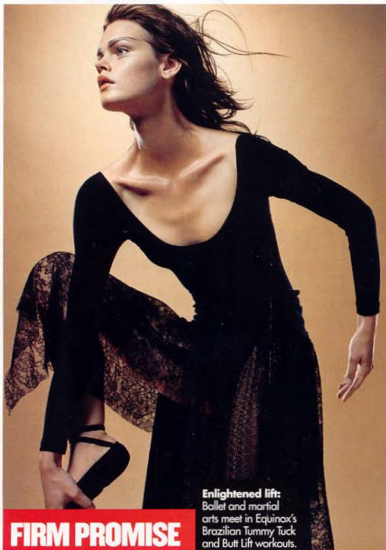
Enlightened lift: Ballet and martial arts meet in Equinox's Brazilian Tummy Tuck and Butt Lift workouts.